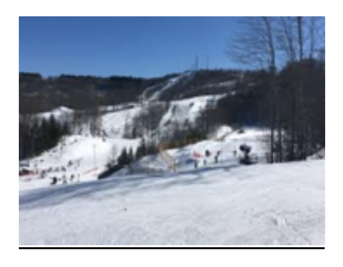
DAY TRIP. Contact David Moore for tickets, $40 per ticket, good any time this season.