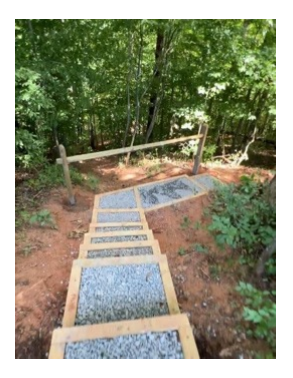
New steps are installed at Fisher Farm Park in Ridgeway, VA.