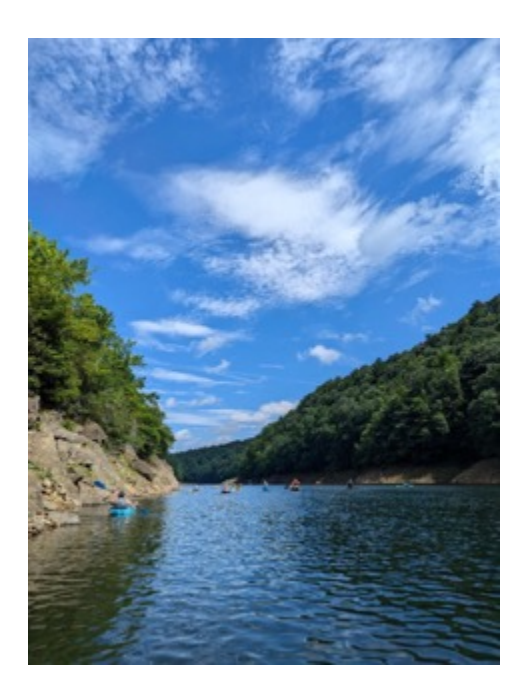
Big crowd came out to enjoy a paddle at DRBA's July FSO!