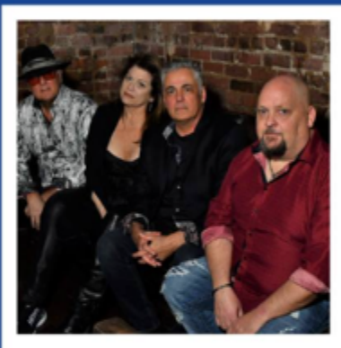
July 21st Radio Revolver