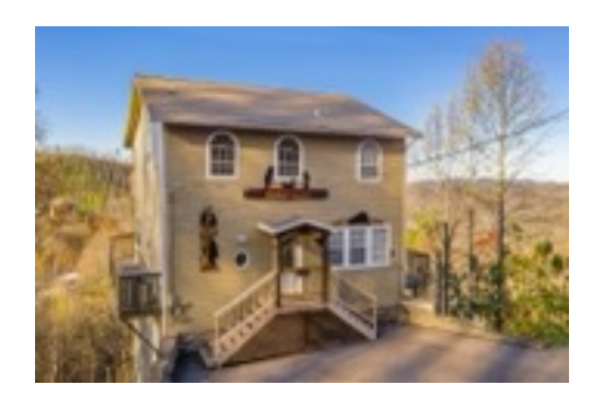
TRIP IS FULL

October 11-14 (staying 3 nights in a house with amazing views, hot tub, etc)