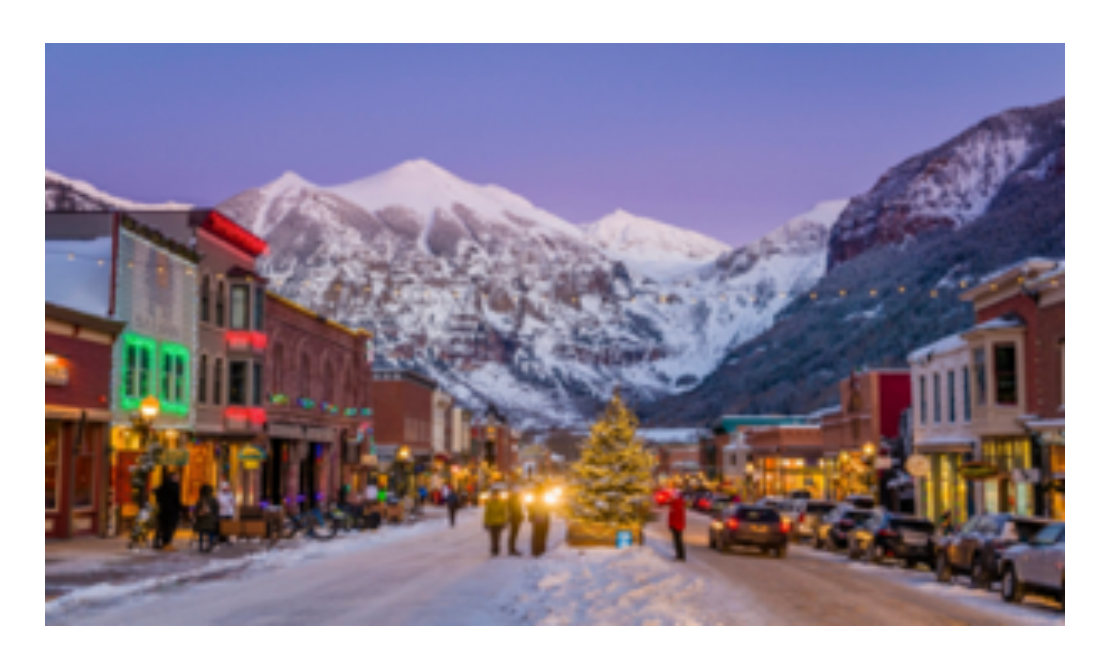
Ranked #1 Best Small Town to Visit