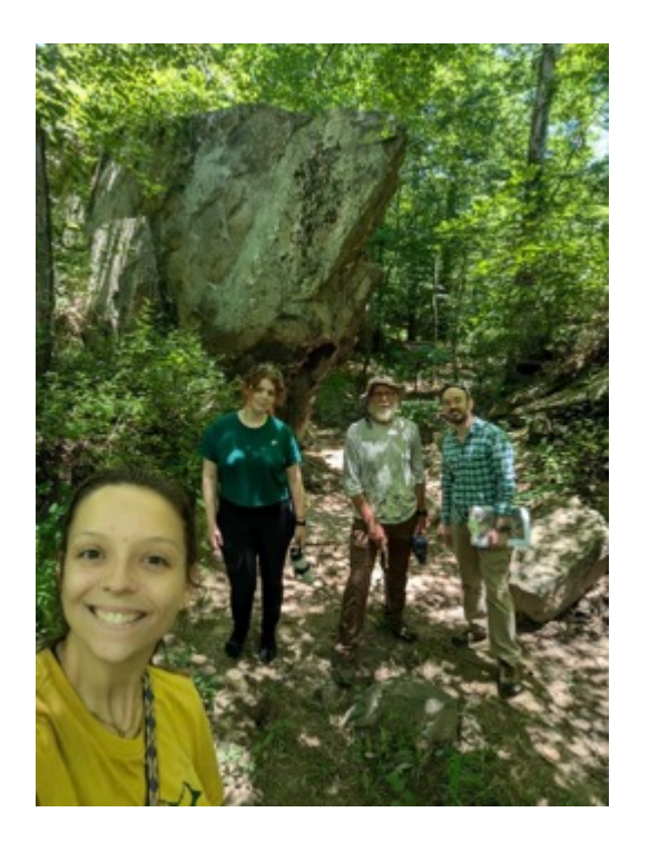
A new extension to the trail is marked at the historic High Rock Trail in Wentworth, NC.