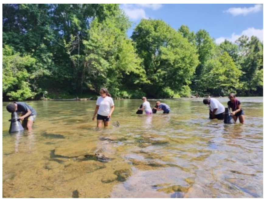
MHC After 3 youth learn about water quality and ecosystems on the Smith.