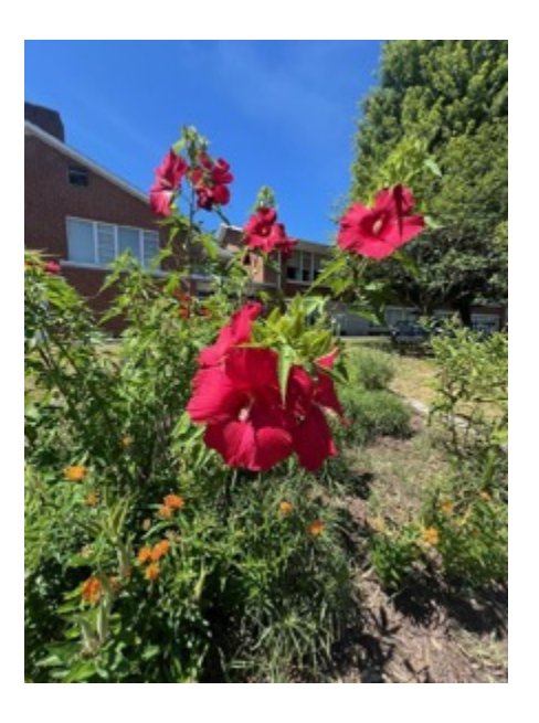
The Monarch Waystation DRBA created at the Virginia Museum of Natural History in 2021 is still thriving!